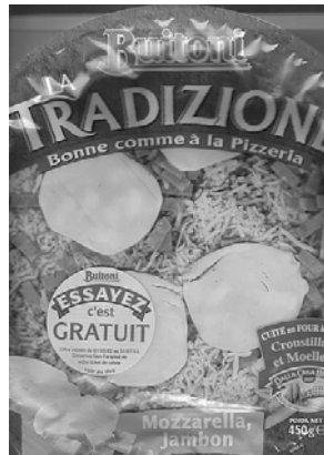
Figure 2. Return of techniques as a marketing strategy

salubriousness of the products themselves. Some examples can be found in GMO-free or organic products, or in raw materials which are derived from autochthonous or abandoned varieties such as " Farro " ( Triticum turgidum dicoccum , T. spelta ). Some of these products recall a more remarkable return to a "past" which has been deemed to be virtuous whereas other products are merely the result of a marketing strategy. In this last case we list products of the big-scale agro-industries which entice the consumer into thinking about an idyllic vision of the rural world even if they apply modern productive methods (Fig. 2). Anyhow, the genuine return to traditional products can face several obstacles in particular vis-à-vis the health legislation. This does not always take into account traditional products in the furrow of food safety in the (post) modern sense of the word.